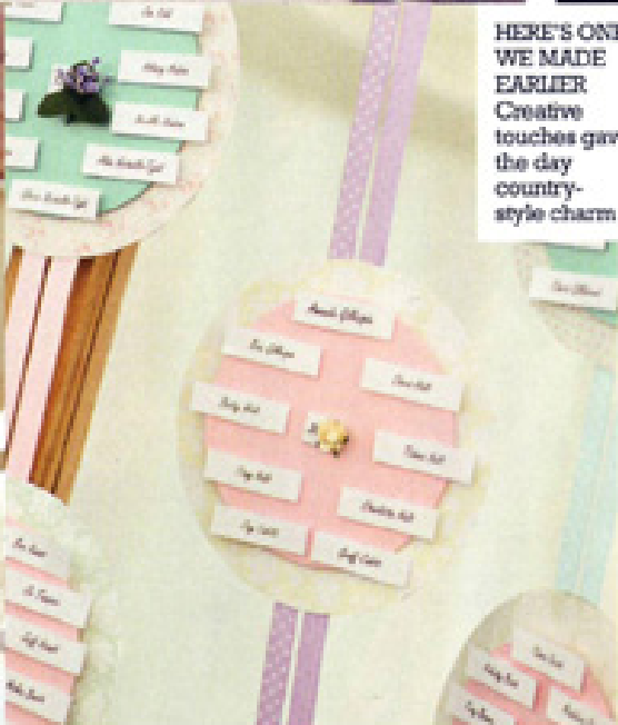
HERE'S ONE WE MADE EARLIER Creative touches gave the day country-style charm